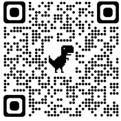
TABLE SPONSORSHIPS AND ADMISSIONS